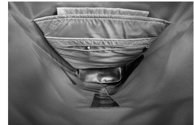
Notebook sleeve for laptops